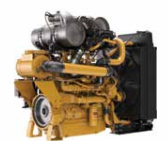
Optional IPU shown with engine-mounted aftertreatment (EMAT)